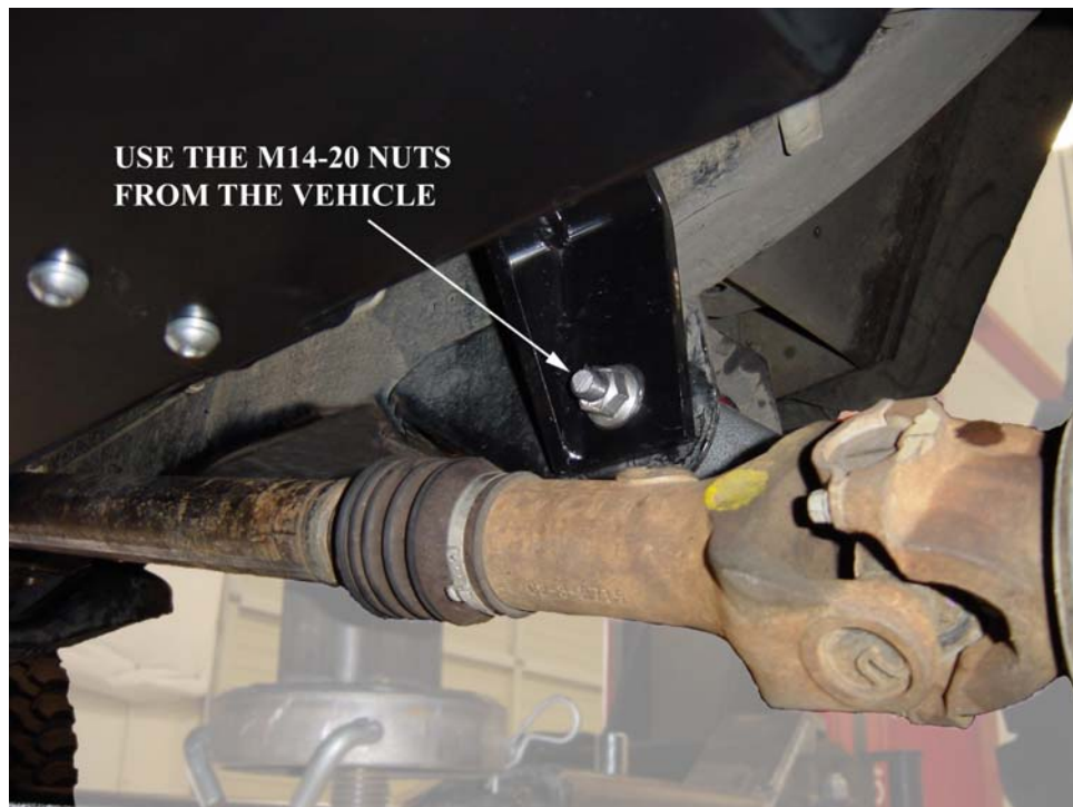
Figure 2: DRIVER'S SIDE MOUNTING LOCATION.