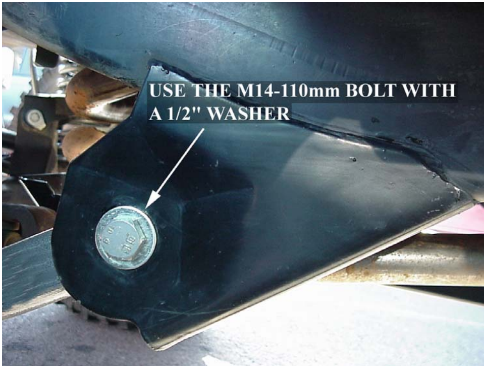
Figure 4: INSTALL THE M14 BOLTS FROM THE OUTSIDE.