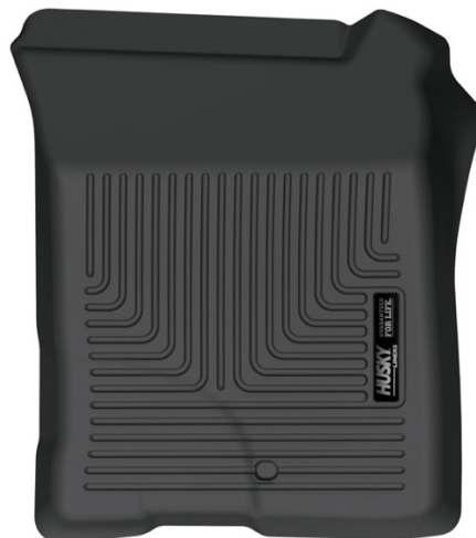
RIGHT OR PASSENGER'S

TO EASE INSTALLATION OF YOUR NEW FRONT LINERS, MOVE BOTH FRONT ROW SEATS TO THEIR MOST REARWARD POSITION. WITH THIS DONE, INSTALL THE LINERS AS SHOWN ABOVE. THE DRIVER SIDE LINER WILL ATTACH TO THE FACTORY FLOOR MAT RETAINING POSTS. ONCE YOU HAVE INSTALLED YOUR LINERS, REPOSITION THE SEATS AS DESIRED.