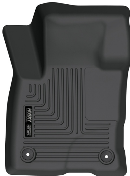
LEFT OR DRIVER'S