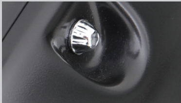
STAINLESS STEEL M1 RIVETS