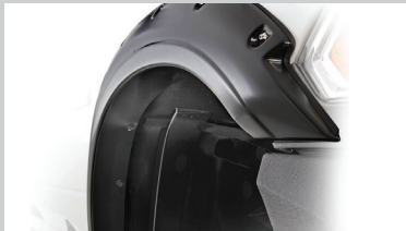
UP TO 2" PROTECTION